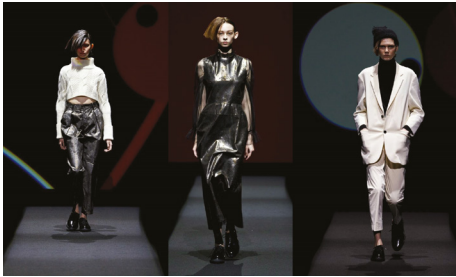
Lanvin – F/W Capsule Collection

Founded in 1972, Alcantara represents one of the leading Made in Italy brands. A registered trademark of Alcantara S.p.A. and the result of unique and proprietary technology, Alcantara® is a highly innovative material offering an unparalleled combination of sensory, aesthetic and functional characteristics.