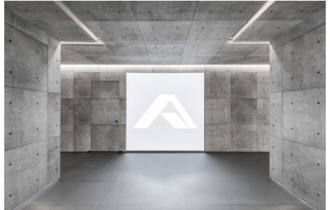
Alcantara S.p.A – Milan Headquarters

Thanks to its extraordinary qualities and values, Alcantara is the chosen material for leading brands in many fields of application : fashion and accessories, automotive, marine and aviation, interior design and consumer-electronics.