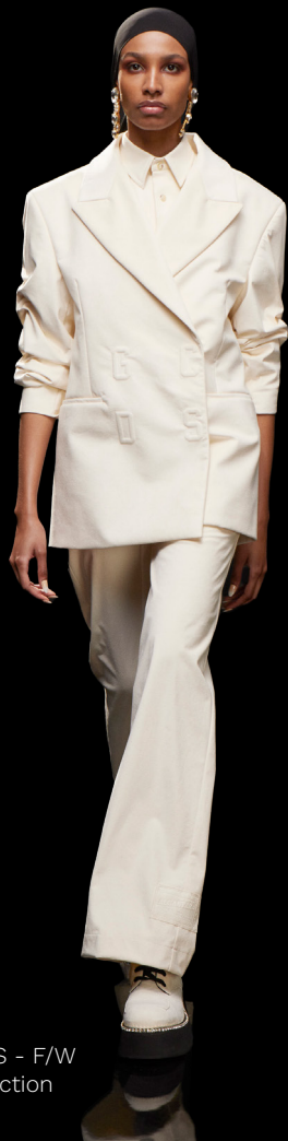
GCDS - F/W Collection