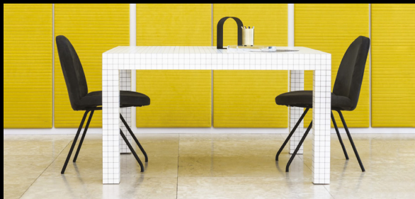
Alcantara interior concept

The versatility of Alcantara, capable of marrying tradition and innovation , technology and craftsmanship, brings life to an infinite array of applications.