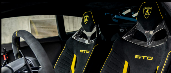
Lamborghini - Huracán STO