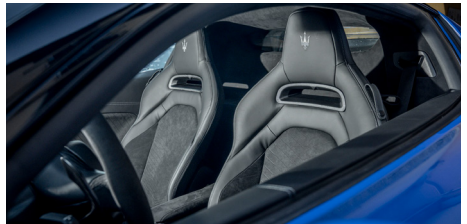
Maserati - MC20

These features, together with a serious and certified commitment to sustainability, make Alcantara a true icon of contemporary lifestyle.