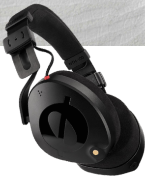
Rode - NTH 100