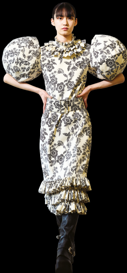
FUMIE=TANAKA F/W Capsule Collection