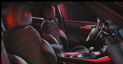
Alfa Romeo - Tonale