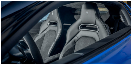
Maserati – MC20

These features, together with a serious and certified commitment to sustainability, make Alcantara a true icon of contemporary lifestyle.