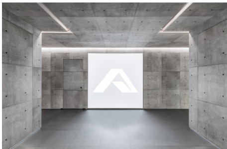
Alcantara S.p.A – Milan Headquarters

Thanks to its extraordinary qualities and values, Alcantara is the chosen material for leading brands in many fields of application : fashion and accessories, automotive, marine and aviation, interior design and consumer-electronics.