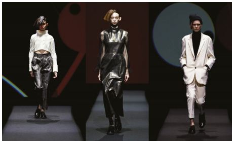
Lanvin – F/W Capsule Collection

Founded in 1972, Alcantara represents one of the leading Made in Italy brands. A registered trademark of Alcantara S.p.A. and the result of unique and proprietary technology, Alcantara® is a highly innovative material offering an unparalleled combination of sensory, aesthetic and functional characteristics.