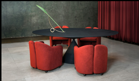
Alcantara interior concept

The versatility of Alcantara, capable of marrying tradition and innovation , technology and craftsmanship, brings life to an infinite array of applications.